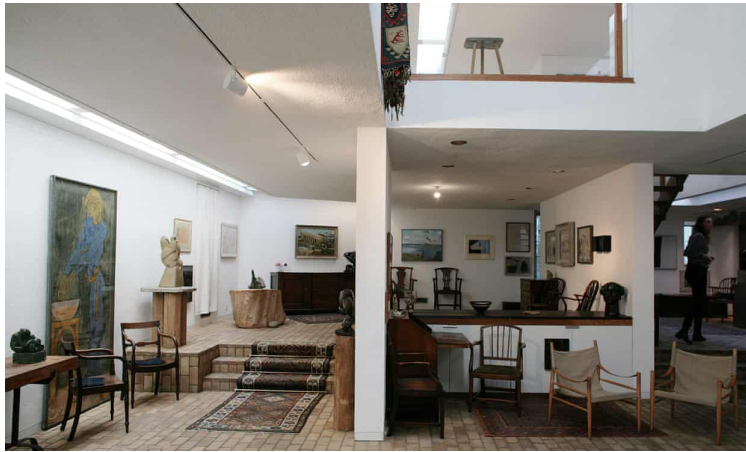
Kettle's Yard house and art gallery in Cambridge.