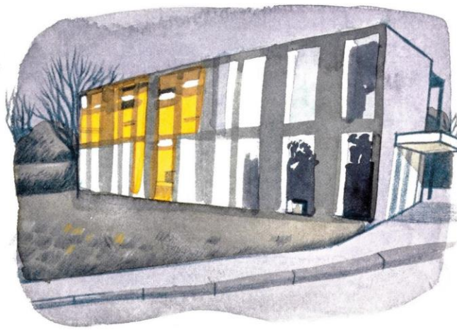
Above: Wysing Arts Centre, an important influence on the contemporary art scene in Cambridge

Then, of course, there are the colleges. Oxford's purpose-built Christ Church Picture Gallery has been around since 1968, but it has taken till 2016 for Cambridge to open its first public college art gallery – not at Christ's, King's or Trinity, but at Downing. Designed by Caruso St John, the Heong Gallery echoes