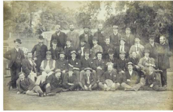
Workforce of F R Leach & Sons c. 1882